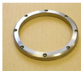
HM07/ HM08 Ceramic Retaining Ring