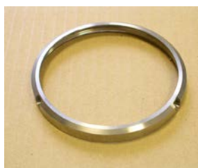
HM06 Ceramic Retaining Ring

In order to ensure continued protection of the Ceramic Retaining Ring, the Protection Ring must also be regularly checked and replaced when worn (details of when replacement is necessary are described in Engineering Note EN0057). If these instructions are NOT followed, the Protection Ring may wear through to the Ceramic Retaining Ring.